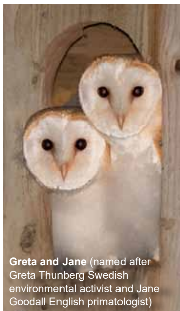
Greta and Jane (named after Greta Thunberg Swedish environmental activist and Jane Goodall English primatologist)

They are just beginning to venture outside and explore their surroundings.