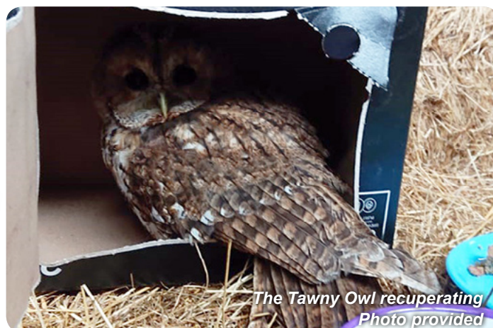
The Tawny Owl recuperating Photo provided