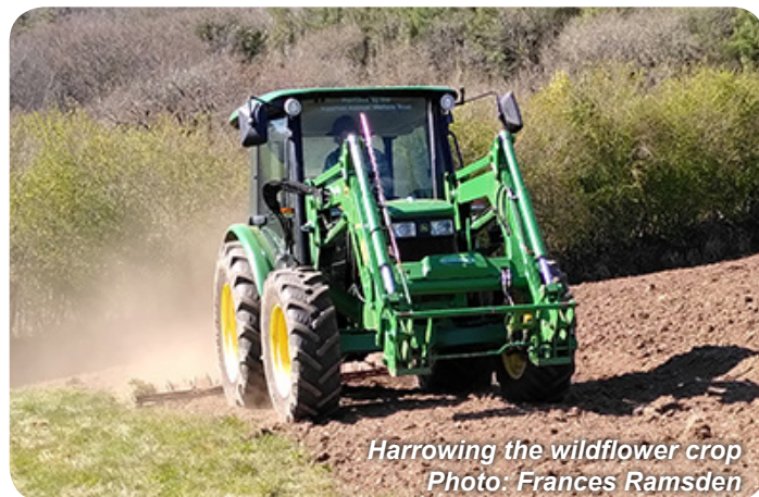
Harrowing the wildflower crop

By the end of March the Blackthorn in the hedges and the Plum trees in the orchard were in full bloom and the top of the field was a carpet of Celandines shining out in the rough grassland. The birdsong this month was delightful, a chorus of Linnets with Great Tit, Robin and Blue Tit, and then there is the Skylark who was still being seen and heard most days – glorious!