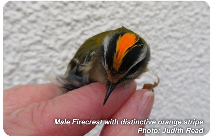
Male Firecrest with distinctive orange stripe

The really fun bit of ringing is either catching a bird that has been ringed elsewhere or receiving information about a bird that you have ringed and has later been recovered. Sadly, in many of the latter cases the bird will have been found dead.