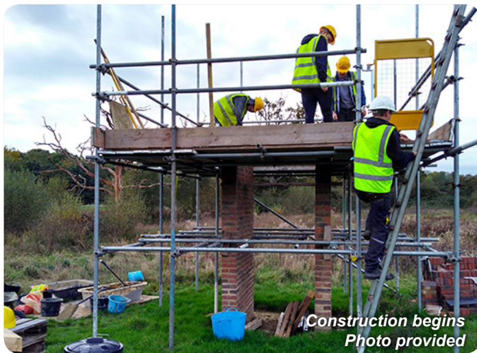
Construction begins

Bough Beech Reservoir is well known by many bird watchers as a good place to see many bird species.