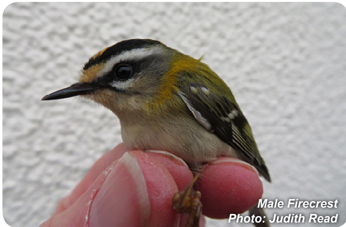
Male Firecrest

One of the schemes that the BTO runs within the Ringing Scheme is the Constant Effort Site (CES). The purpose of CES is to gather information about the numbers of adult and juvenile birds together with productivity and adult survival rates. This indicates whether species are doing well, or not. As suggested by the title each ringing session runs for the same length of time and uses the same amount of netting each time in the same places. It is undertaken during regular set periods and has been running since 1983. Up to now it has operated mainly in reed-bed and scrub habitats.