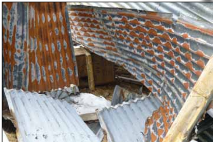
The collapsed barn with the nestbox just visible