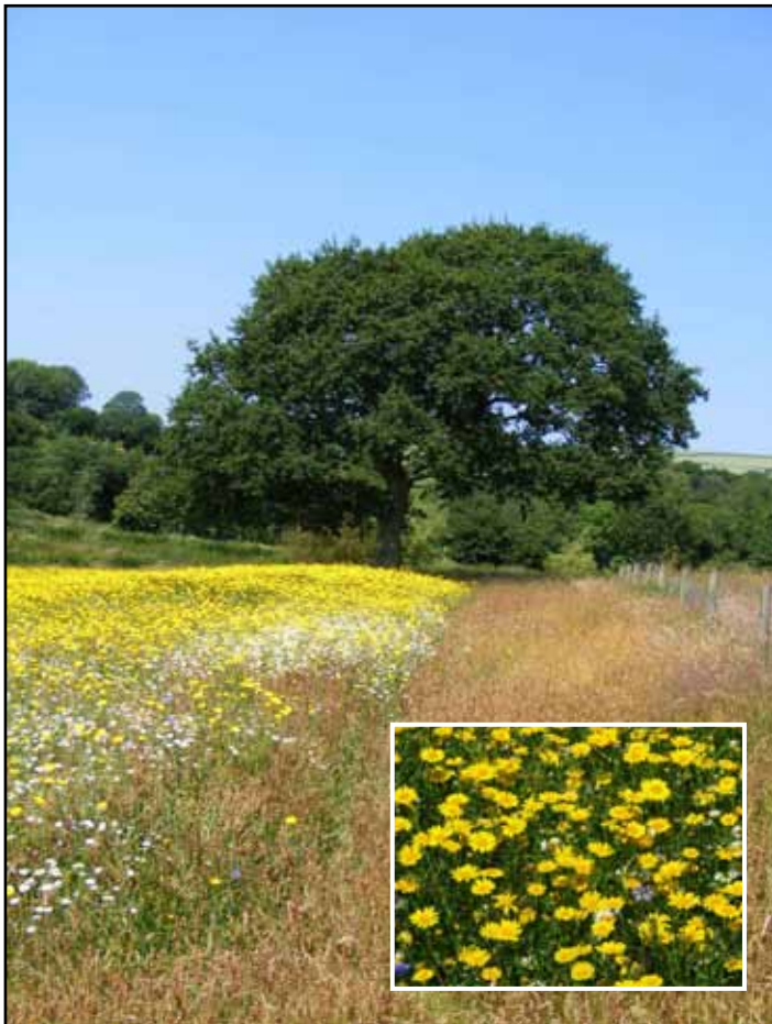
Above: Some areas are ploughed and seeded with an annual flower mix