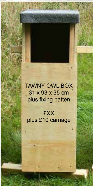
TAWNY OWL BOX 31 x 93 x 35 cm plus fixing batten