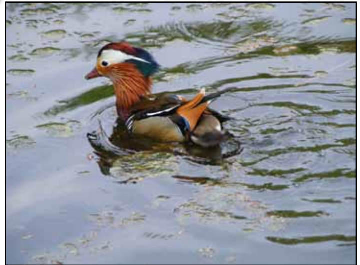
The Mandarin drake on the 'Flo Pond'

The spring began slowly with a terribly cold and wet March. The mean temperature here was 3.8°C compared with 8.7°C in 2012 and 11.5°C in 2011 and we had 156mm of rain (23.4mm in 2012 and 20mm in 2011). Despite this a Small Tortoiseshell and a Peacock managed to put in an appearance on the 5th. A month later, the UK Butterfly Monitoring Scheme should have started but temperatures were still too low. Nevertheless, a further two Small Tortoiseshells and another Peacock braved the biting northerly wind to bask on some bramble. By the end of April, things had improved sufficiently for Orange-tip and Brimstone to be on the wing, with numbers of Small Tortoiseshell into double figures. Numbers continued to build through the spring and into the summer as a high pressure established itself. By the end of June, temperatures were consistently above 25°C and our butterflies thrived; 63 Marbled Whites were recorded in early July, whilst 260 Meadow Browns, 36 Small Skippers and 6 Small Coppers had been seen by mid-month, along with the first Gatekeepers of the year.