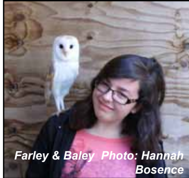
Farley & Baley

"I chose the Barn Owl Trust for my Work Experience because I have always been interested in the conservation of owls; when I saw the Barn Owl Trust on my work experience options, the idea really appealed to me and I haven't regretted my decision since arriving.