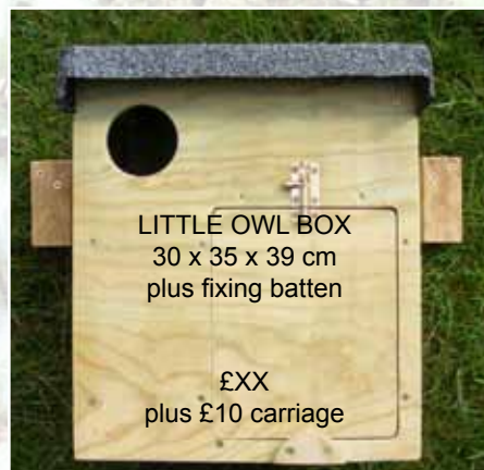
LITTLE OWL BOX 30 x 35 x 39 cm plus fixing batten

Our new Little Owl box has been designed by Bob Sheppard, who has had great success with this design in Lincolnshire with 44 breeding pairs this year. This box is very specific to Little Owls, the size of the entrance hole, the baffle to decrease light in the box and the internal measurements are all key