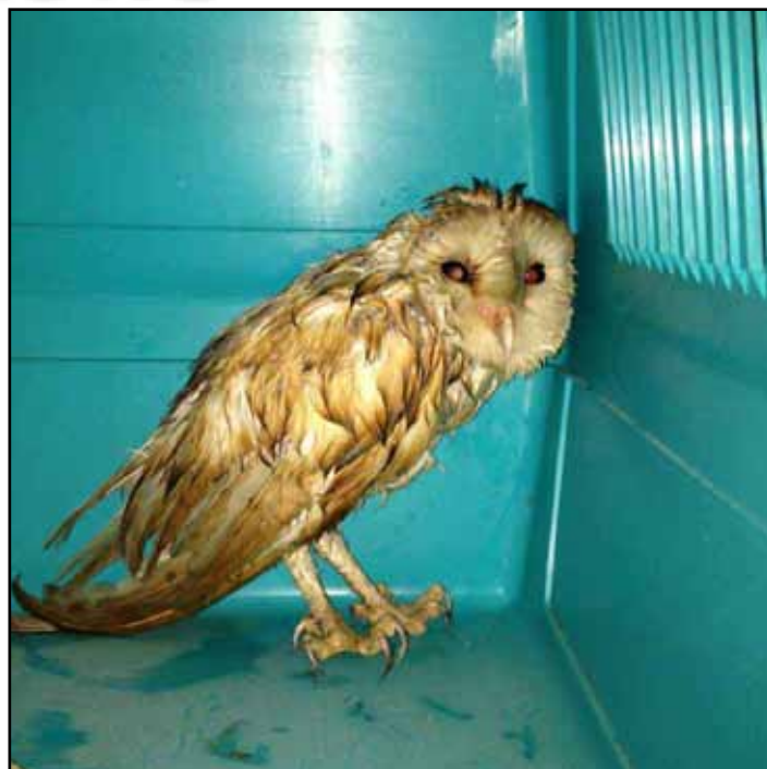
The soggy guest, whilst waiting for advice from the BOT