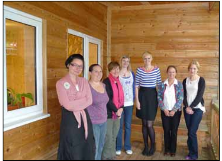
RSPB office staff at the BOT

Was it worth it? YES. The rodenticide manufacturers, the user groups including Pest Control Officers and Gamekeepers, the Trade Associations, the Chartered Institute of Environmental Health, the Health and Safety Executive's Pesticide Regulation Directorate, and the Environmental Scientists that provide vital evidence-base for the discussions (particularly the Centre for Ecology and Hydrology's Predatory Bird Monitoring Scheme) are now much more aware of the need to reduce secondary poisoning, particularly of Kestrels, Red Kites, and of course Barn Owls. As a result of the presentation the Trust was invited by the Chartered Institute of Environmental Health to submit an article to their newsletter; see Pest Control News - PCN Issue 95. ★