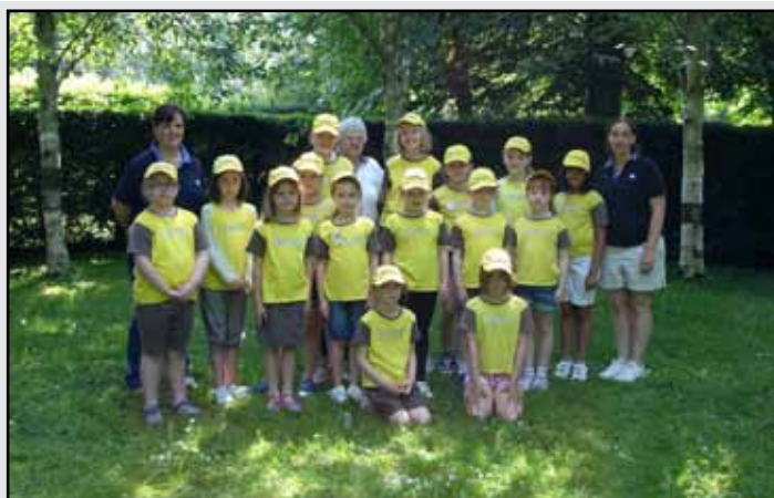
The Barn Owl Trust was the charity chosen by the 1st Barton Le Clay brownies (Bedfordshire) at their 'endangered animals' pack holiday, they sent us £30 and this great picture.

The Grizzly Run, otherwise known as Grime and Punishment, is an annual event held in East Devon. The run is about 21mils with as much climb as run and entry is by lottery. The Axe Valley Runners have donated £550 to the Trust from the run over the last four years - thank you, you hardy folk.