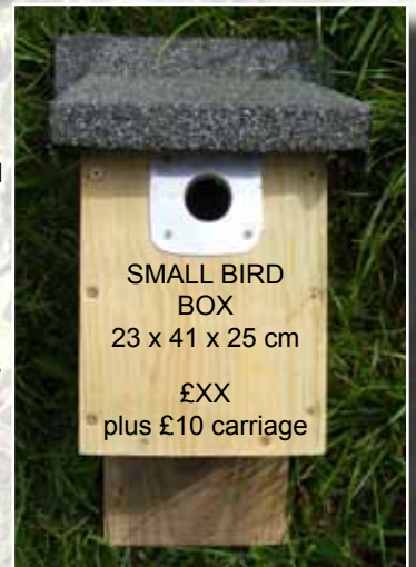
SMALL BIRD BOX 23 x 41 x 25 cm £XX plus £10 carriage

The Small Bird box design we use is again from the BTO, and whilst there are many variations of the design out there you can rest assured our box has all the key features small birds look for. Again, it's built to last with three-quarter inch treated plank and 18mm pressure treated ply. It has an opening lid, with thick torch-on-felt forming the hinge and overhanging the sides. The box is sealed to make it weather proof, has a 28mm entrance hole and a metal plate to stop the hole being widened by squirrels or woodpeckers. Although primarily designed for tits, the box can house many other species of small birds. This box costs **, and there is also a flat pack version at the lower price of **. For those wanting to put up multiple boxes we offer a bulk order price; contact the BOT office for further details.